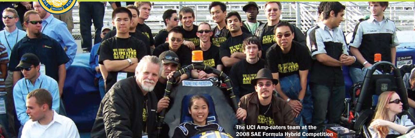
The UCI Amp-eaters team at the 2008 SAE Formula Hybrid Competition